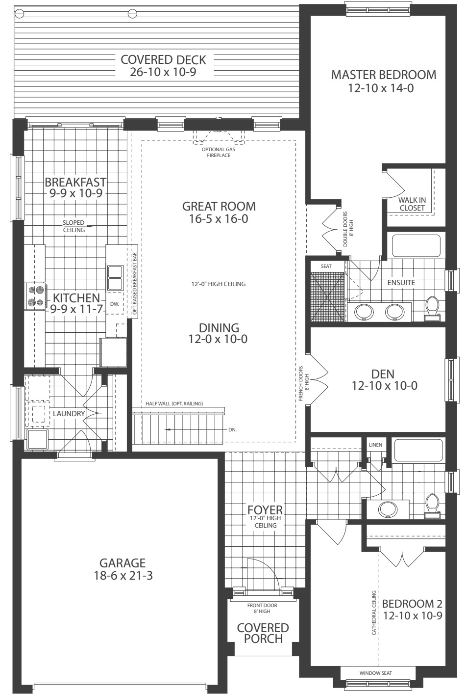
MAIN FLOOR ELEVATION B